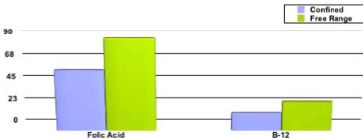
A. Tulan et al, "Studies on the Composition of Food, The chemical composition of eggs

Data above was taken from the October/November 2007 issue of "Mother Earth News."